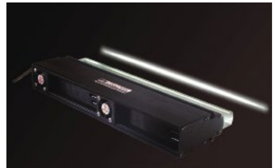
HB White LED lightline from Advanced Illumination