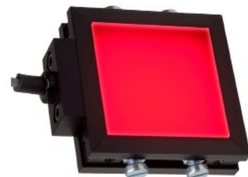
HB Red LED backlight from Advanced Illumination