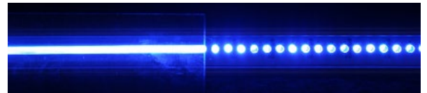
LED lightline with 40^\circ \times 1^\circ diffuser on the left