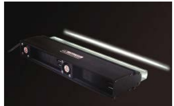
HB White LED lightline from Advanced Illumination