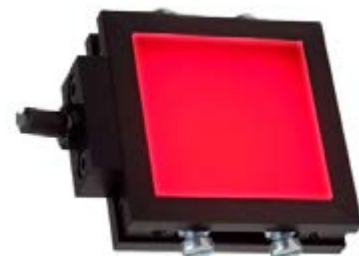
HB Red LED backlight from Advanced Illumination