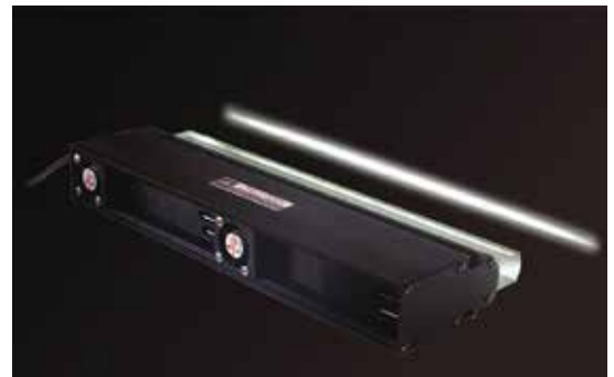
HB White LED lightline from Advanced Illumination