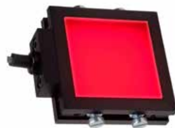
HB Red LED backlight from Advanced Illumination