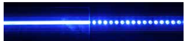
LED lightline with 40° x 0.2° Diffuser on the left

Highly uniform backlights are required for inspection of transparent objects (e.g. bottles, LCD glass, etc) to detect imperfections or cracks. Luminit's symmetrical diffusers homogenize the backlight (either edge-lit or direct back-lit), resulting in more repeatable and accurate dimensional measurement of the part under inspection. Circular diffusers are available in any size up to 60" diagonal.